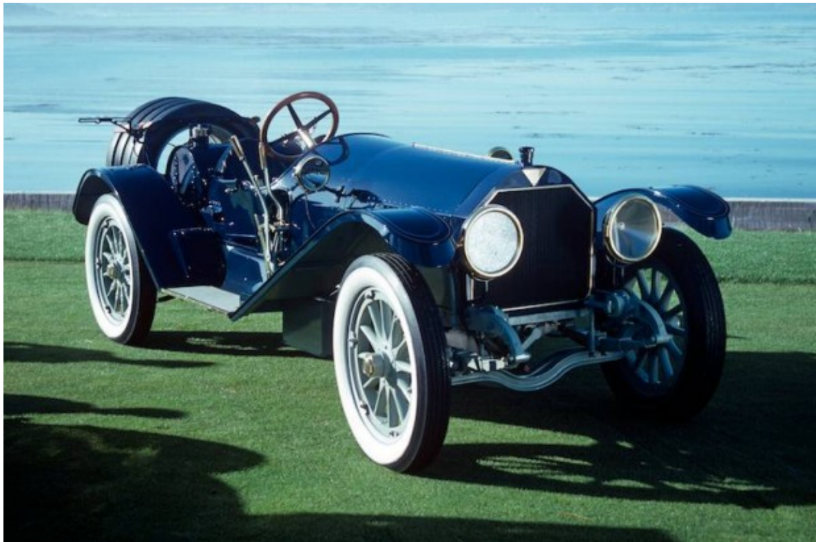
1913 Simplex 75 HP Speedster at the 1993 Pebble Beach Concours