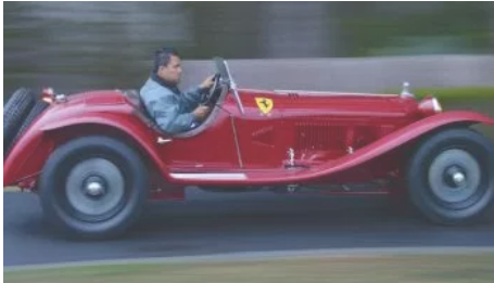
Pebble Beach Concours d'Elegance 2013 - Picture Gallery