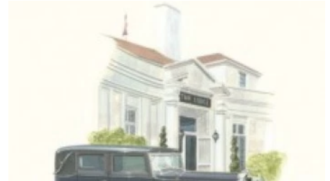
Pebble Beach Concours 2013 Information