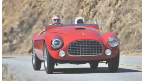
Pebble Beach Tour d'Elegance 2013 - Photo Gallery