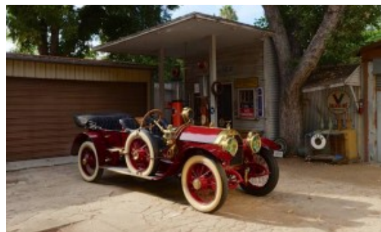
1914 Simplex 50 HP Holbrook 7-Passenger Touring

The 900-mile journey to Southern California from Idaho was going as planned until the World War I Liberty dump truck met the winding, steep and frosty grade known as "The Grapevine"—the primary passage up and over the Tehachapi Mountains into the Los Angeles basin. There, the three-ton