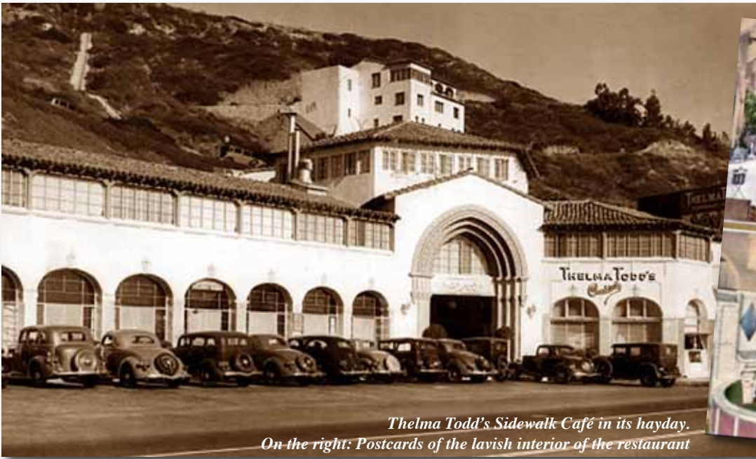
Thelma Todd's Sidewalk Café in its heyday. On the right: Postcards of the lavish interior of the restaurant