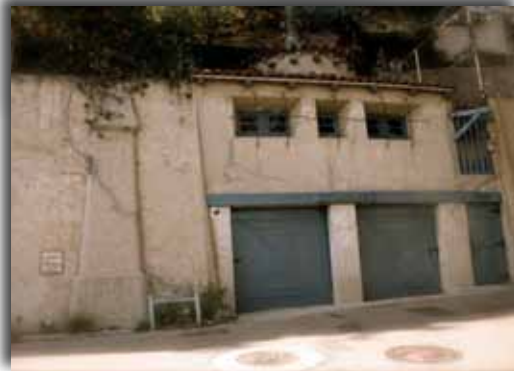
The infamous garage where she was found. Located at 17531 Posetano Road in the Pacific Palisades.