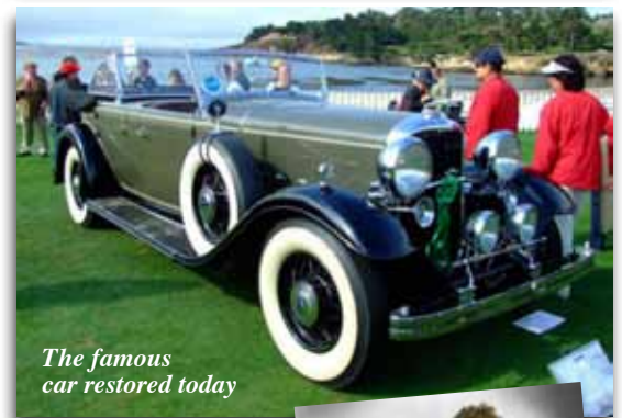
The famous car restored today