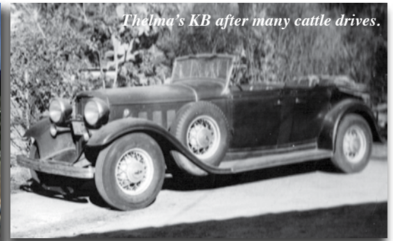
Thelma's KB after many cattle drives.