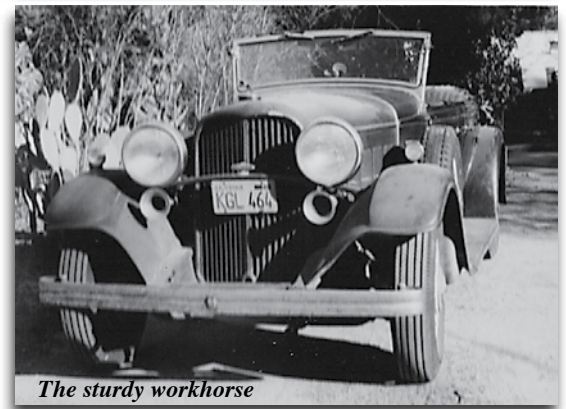
The sturdy workhorse