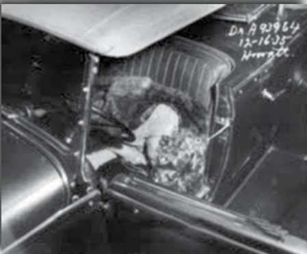
As she was found Monday morning December 16th, 1935