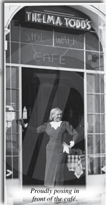
Proudly posing in front of the café.

Todd continued her movie work through 1935, and was featured in the full-length Laurel and Hardy comedy The Bohemian Girl . This was to be her last movie. A mysterious accident ended the ice cream blonde's time on this earth. On December 16th, 1935 she was found dead behind the wheel of her beloved car trapped in the garage where the Lincoln was kept. A victim of accidental asphyxiation forced upon her by her business partner and lover. Arguments over money and alcohol and the pressures of being in the public eye took this beautiful woman to the great beyond in the front seat of her Lincoln. To this day she still has fans that mourn her. The building still stands on Pacific Coast Highway as a silent reminder of the golden days of Hollywood.