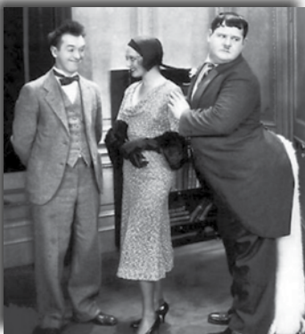
Thelma in "The Bohemian Girl" 1935.

Thelma Alice Todd (July 29, 1906 – December 16, 1935) born in Lawrence, Massachusetts was an American actress appearing in approximately 120 pictures between 1926 and 1935. She Co-starred with many movie greats such as Laurel and Hardy, The Marx Brothers and Buster Keaton. She also starred in the 1931 film version of The Maltese Falcon starring Ricardo Cortez as Sam Spade. She received her 1932 KB Lincoln from the Maddux dealership. This photo was taken on the day of delivery. Her expression of delight over this automobile is genuine. She really loved her car.